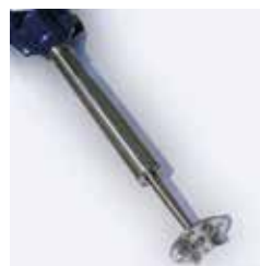
← Particular. Protective shaft with special impeller