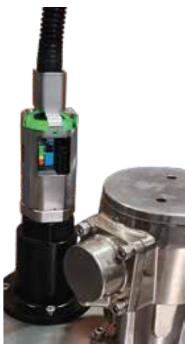
← Level cover with stainless steel colour viewer protection